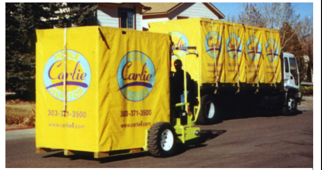
Easy to operate. Requires less training for operator.