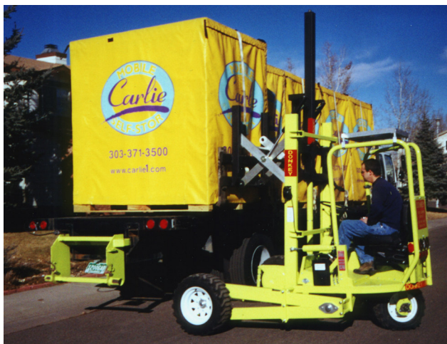
Designed to handle long loads.