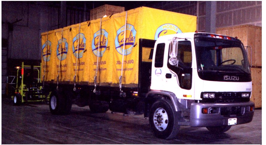
Low operating weight truck carried Donkey is suitable for use on single axle truck. CDL license not required.